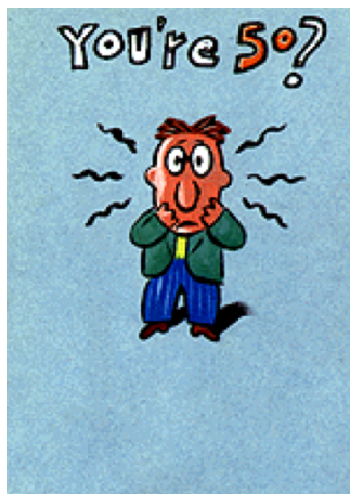
... but you look so natural and lifelike!

American society has been described as maintaining a stereotypic and often negative perception of older adults (Busse, 1968). This negative and/or stereotypic perception of aging and aged individuals is readily apparent in such areas as language, media, and humor. For example, such commonly used phrases as "over the hill" and "don't be an old fuddy-duddy" denote old age as a period of impotency and incompetency (Nuessel, 1982). The term used to describe this stereotypic and often negative bias against older adults is "ageism" (Butler, 1969).